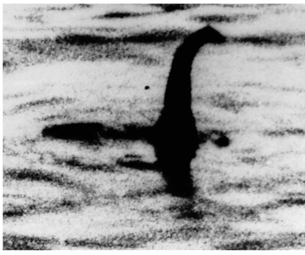
A purported photo of the fabled Loch Ness monster.

The Loch Ness Monster of Scotland is perhapthe most famous urban legend of all time.